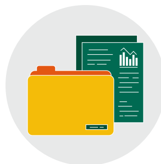
Onboarding 5 work days with Emerald Technology