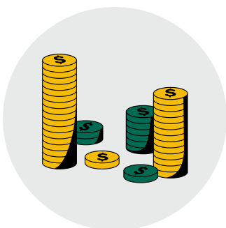
Currency EURO (EUR)

Make growing your team simple with Emerald as a global partner.