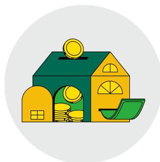
Employer Costs Estimated 45% of employee's salary