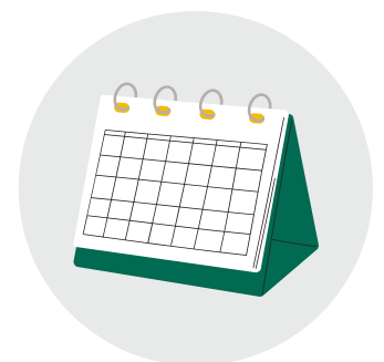
Payroll Cycle Monthly